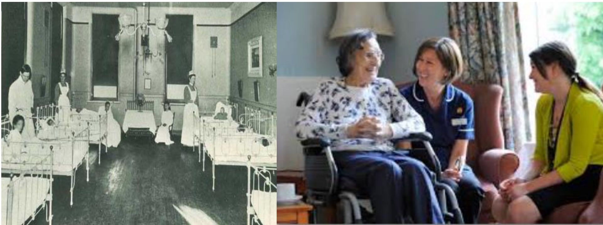
Photo A

Photo B